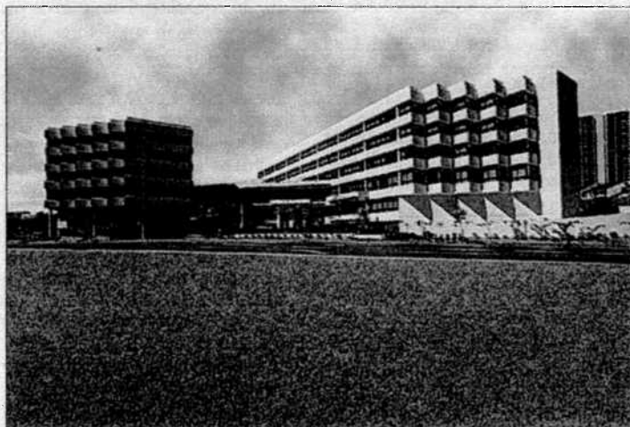
Hawaii Pacific Health

Other hospitals the authors looked at on O'ahu included Hawaii Medical Center-East, Hawaii Medical Center-West, Kuakini Medical Center, The Queen's Medical Center, Straub Clinic & Hospital and Wahiawa General Hospital.